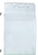
20018 Vertical Flap Badge Holder, Top Load w/ Slot & Chain Holes Clear Vinyl, Data / Credit Card / Military Size (max insert 2 5/8" x 3 7/8")