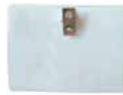
20003 Horizontal Badge Holder, Top Load w/ Clip Clear Vinyl, Data / Credit Card Size (max insert 2 21/64" x 3 5/8")