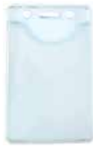
20002 Vertical Badge Holder, Top Load w/ Slot & Chain Holes Clear Vinyl, Data / Credit Card Size (max insert 2 21/64" x 3 5/8")