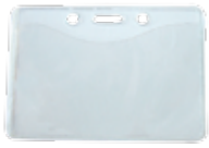
20001 Horizontal Badge Holder, Top Load w/ Slot & Chain Holes Clear Vinyl, Data / Credit Card Size (max insert 2 21/64" x 3 5/8")

BADGE HOLDERS For Conventions & Trade Shows, Meetings & Special Events Various Styles & Sizes Available—One or Two Pocket Holders, Custom Imprinting Foil Stamp & Silkscreen CALL FOR ASSISTANCE : 800-729-3722