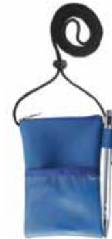
20078RBL 20078BK Vinyl Credential Wallet 6 1/4" x 4 1/4". Front pocket insert size: 3" x 4". Back pocket insert size: 2 1/4" x 4".