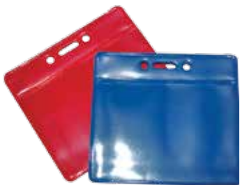
20013 Horizontal Badge Holder, Top Load, Solid Back w/ Slot & Chain Holes Vinyl, Data / Credit Card Size Only (max insert 2 21/64" x 3 5/8" shown in Red & Blue)