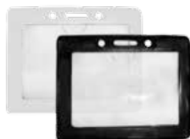
20015 Horizontal Vinyl Badge Holder, Top Load, Color Frame w/ Slot & Chain Holes Vinyl, Data / Credit Card Size Only (max insert 2 3/8" x 3 5/8")