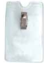
20004 Vertical Badge Holder, Top Load w/ Clip Clear Vinyl, Data / Credit Card Size (max insert 2 21/64" x 3 5/8")