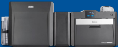
Dual-sided printer/encoder with optional lamination