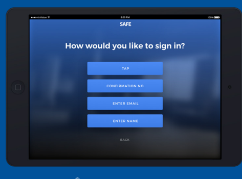
HID SAFE® Visitor kiosk for self-service check-in

The HID SAFE Event Manager add-on feature is designed for those organizations that host large events. This feature allows event managers to delegate event management activities to others working on the event, allowing them to invite others to the event including visitors and other event personnel. Additionally, these delegated event managers can also request access to facilities for event related activities.